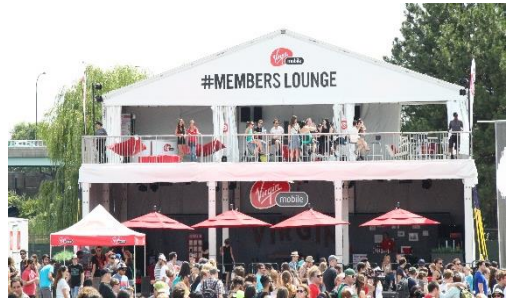
Double Decker Tent