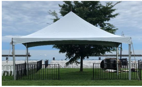
High Peak Tent